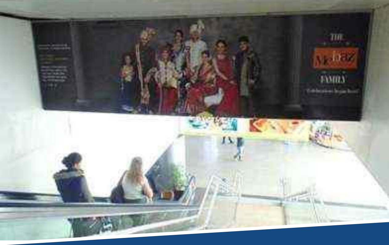
Head On wall Wrap at Bus Gate