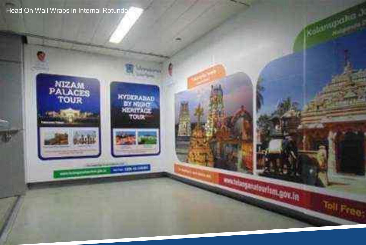
Head On Wall Wraps in Internal Rotunda