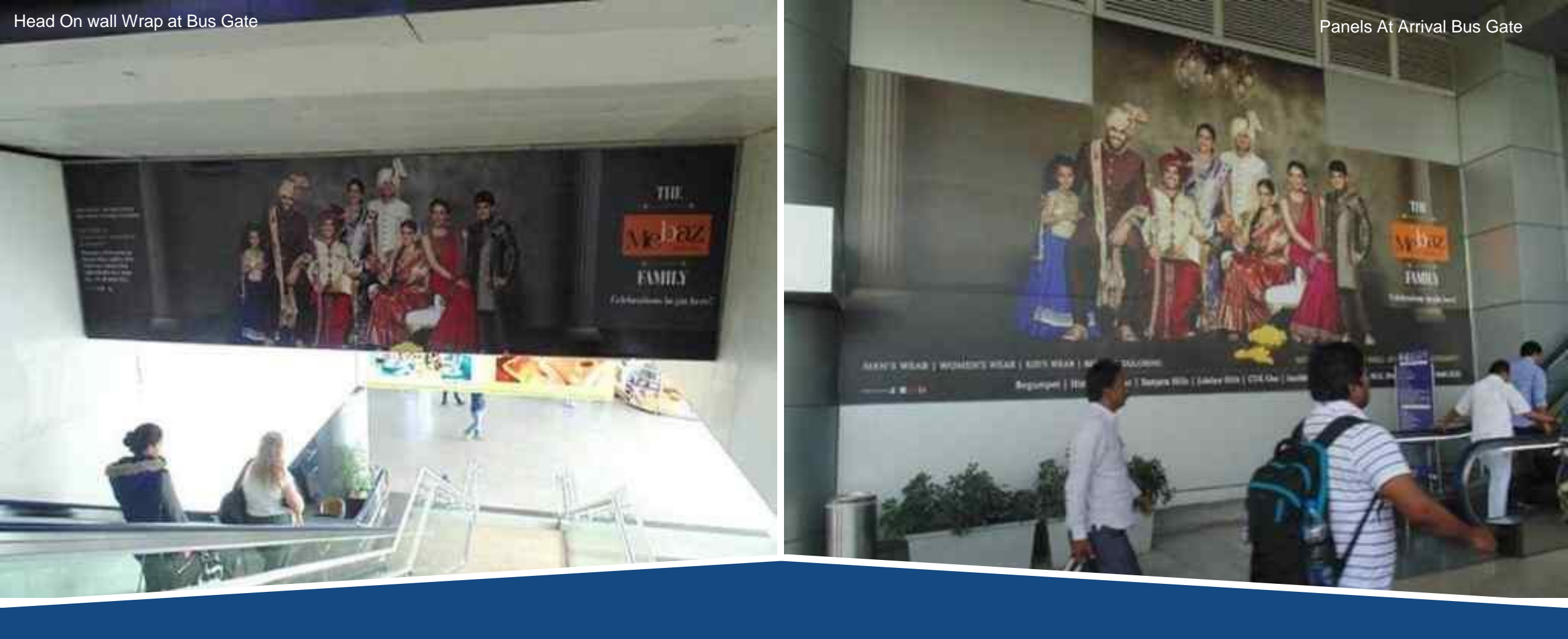
Interior Branding Package