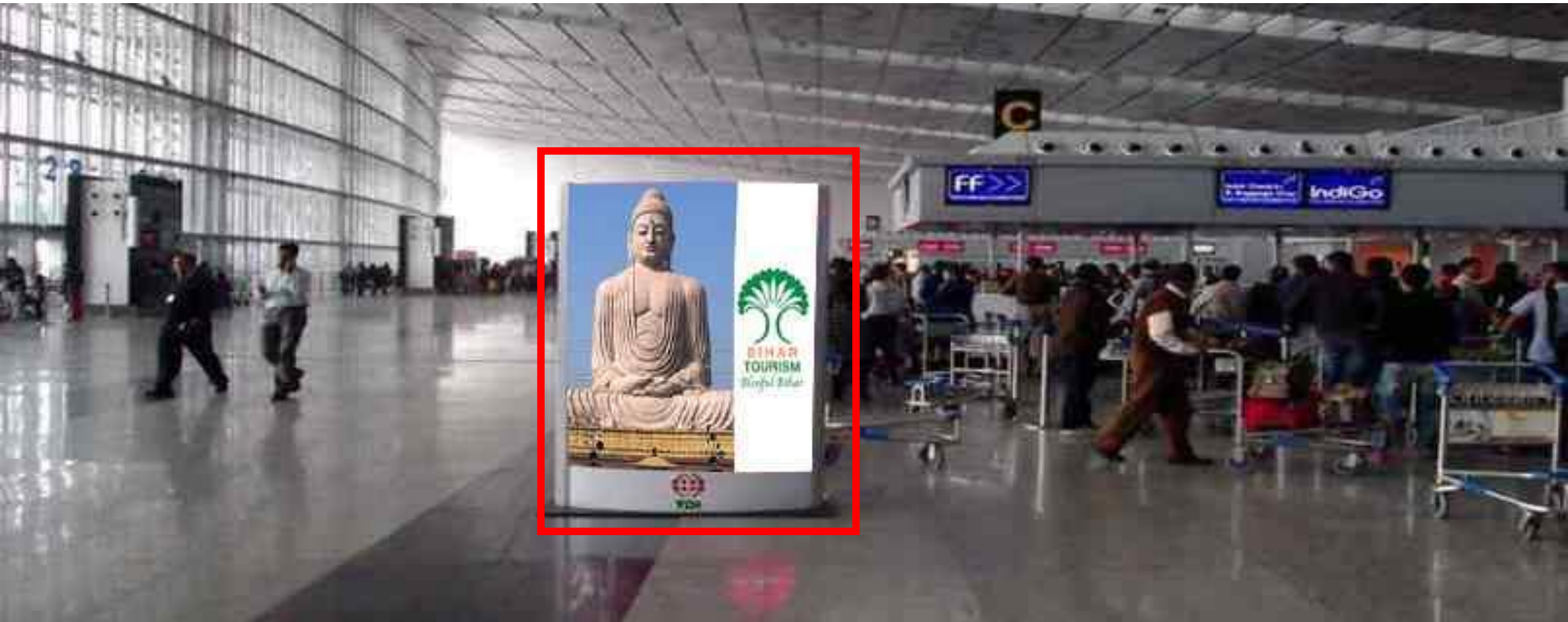
Site no: 02 of Size 4' x6' ( Double Sided Backlit Translite Vertical Totem display visible to all the passengers at the check in area )