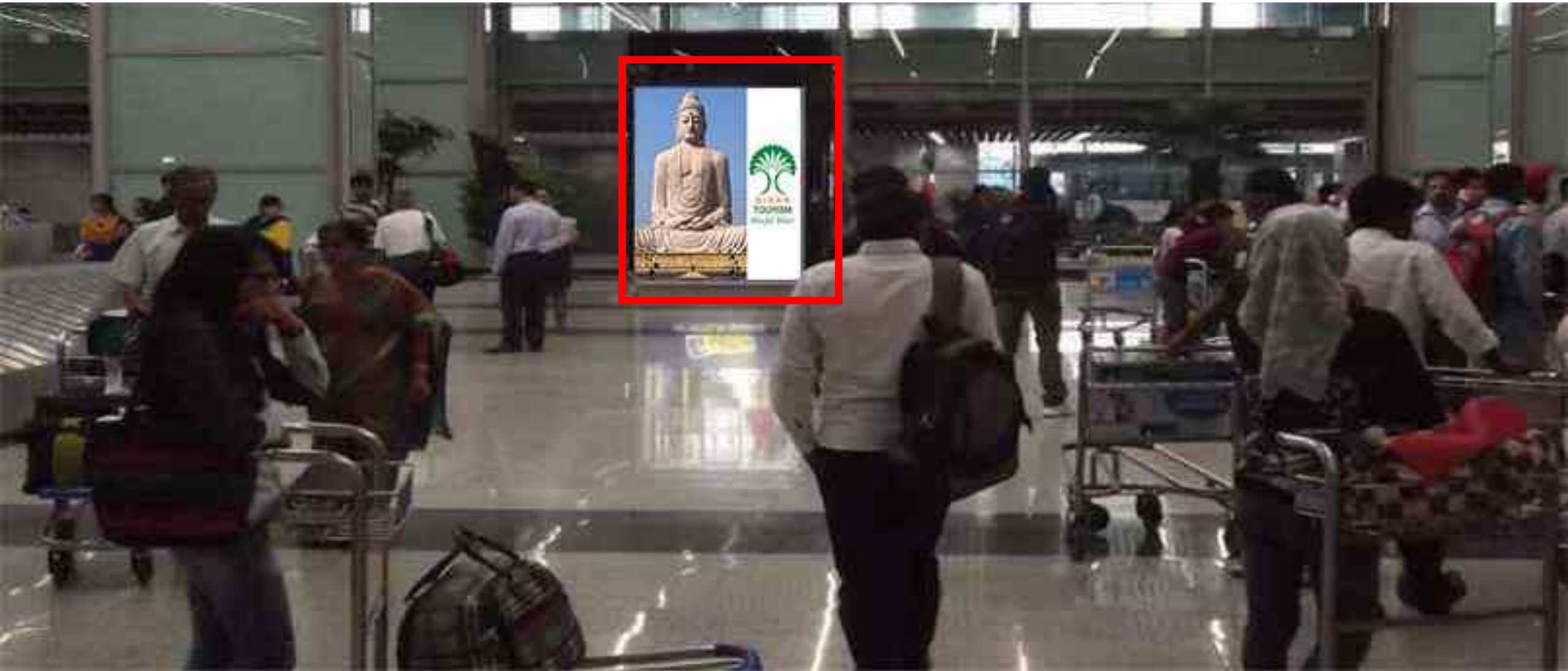
Site no: 03 of Size 6' x9' (Backlit display on the two sides of the baggage collection area in the Indigo Zone )