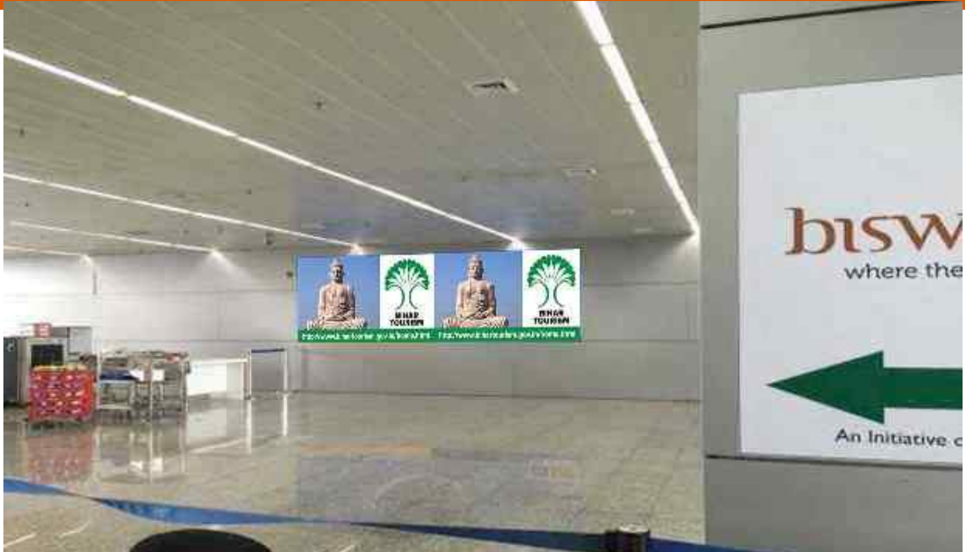
Site no: Pre Security Check of Size 18' x06' (SUBJECT TO AVAILABILITY) (Ambilit Self Adhesive Vinyl display on the right side wall of the Pre Security Check)