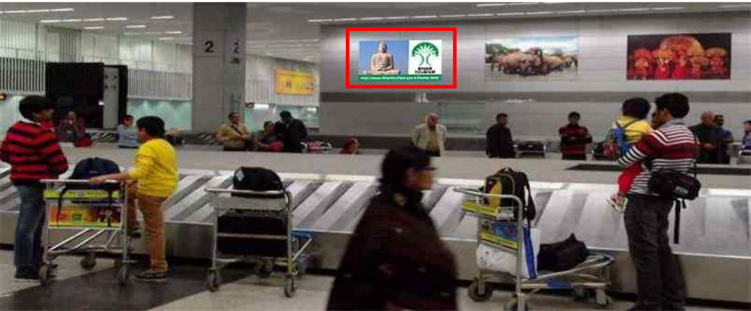
Site no: 14 of Size 12' x8' (Ambilit display on the side wall facing the conveyor belt No 2 &3 visible to all the passengers collecting their baggage from the conveyor belt in the Indigo Zone )