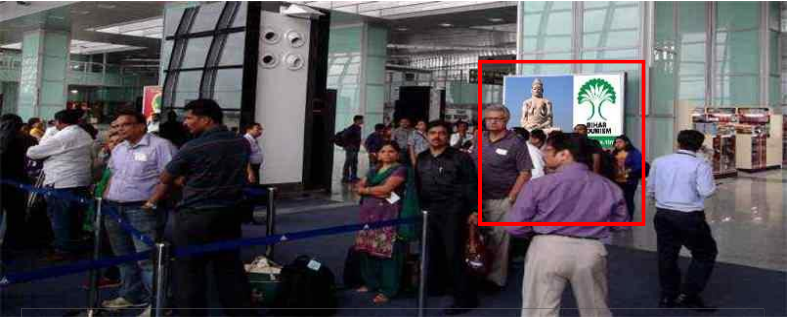
Site no: 25 of Size 9' x9' (Backlit free standing unit display along with glass pillar facing towards passengers seating in the security hold area)