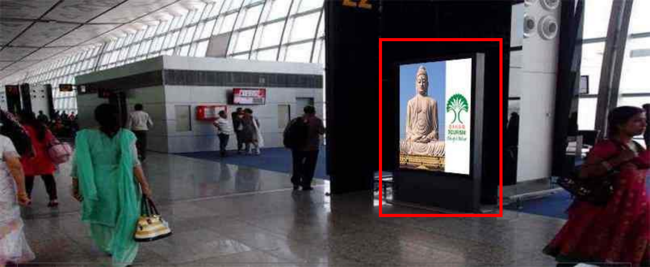
Site no: 30 to 37 of Size 4' x6' (Backlit Translite Vertical Scroller with five different displays(O1 Display in each Scroller on sharing basis) alongside the Air-conditioning Vent Pillars visible to all the passengers at security hold area)