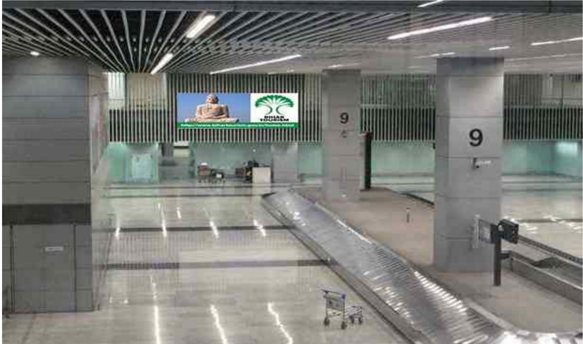
Site no: ARRIVAL LOUNGE of Size 21' x 07' (SUBJECT TO AVAILABILITY) (Ambilit Self Adhesive Vinyl display on the right side wall of the Pre Security Check)