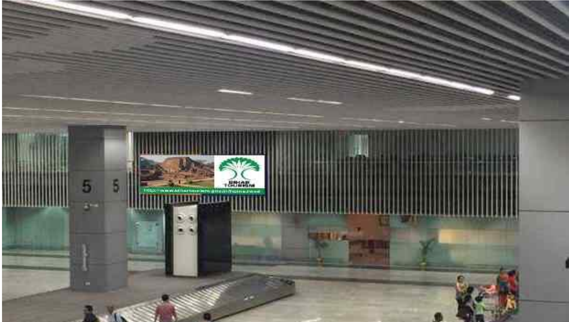
Site no: ARRIVAL LOUNGE of Size 21' x 07' (SUBJECT TO AVAILABILITY) (Ambilit Self Adhesive Vinyl display on the right side wall of the Pre Security Check)