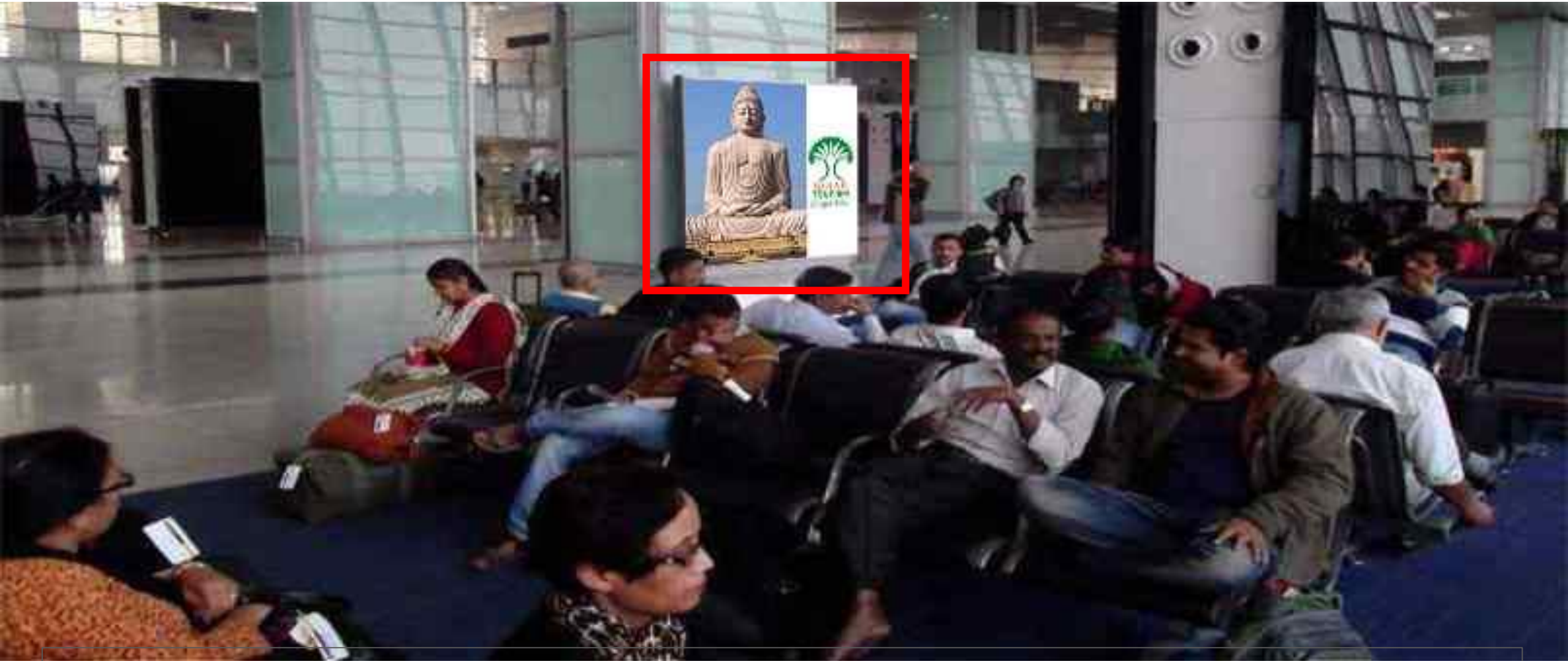
Site no: 27 of Size 9' x9' (Backlit free standing unit display along with glass pillar facing towards passengers seating in the security hold area)