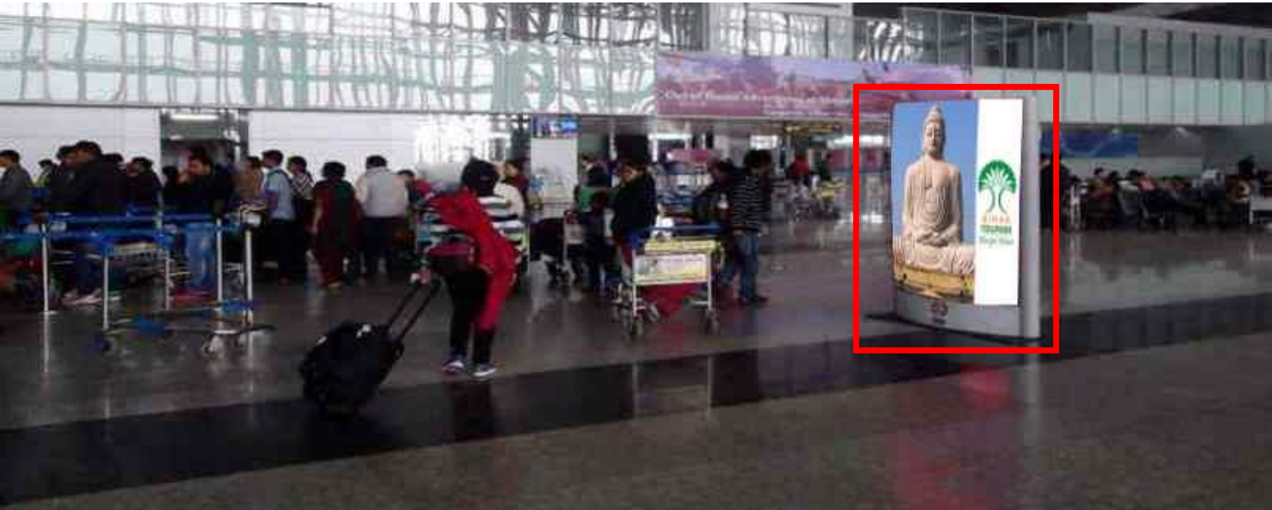
Site no: 02 of Size 4' x6' ( Double Sided Backlit Translite Vertical Totem display visible to all the passengers at the check in area )