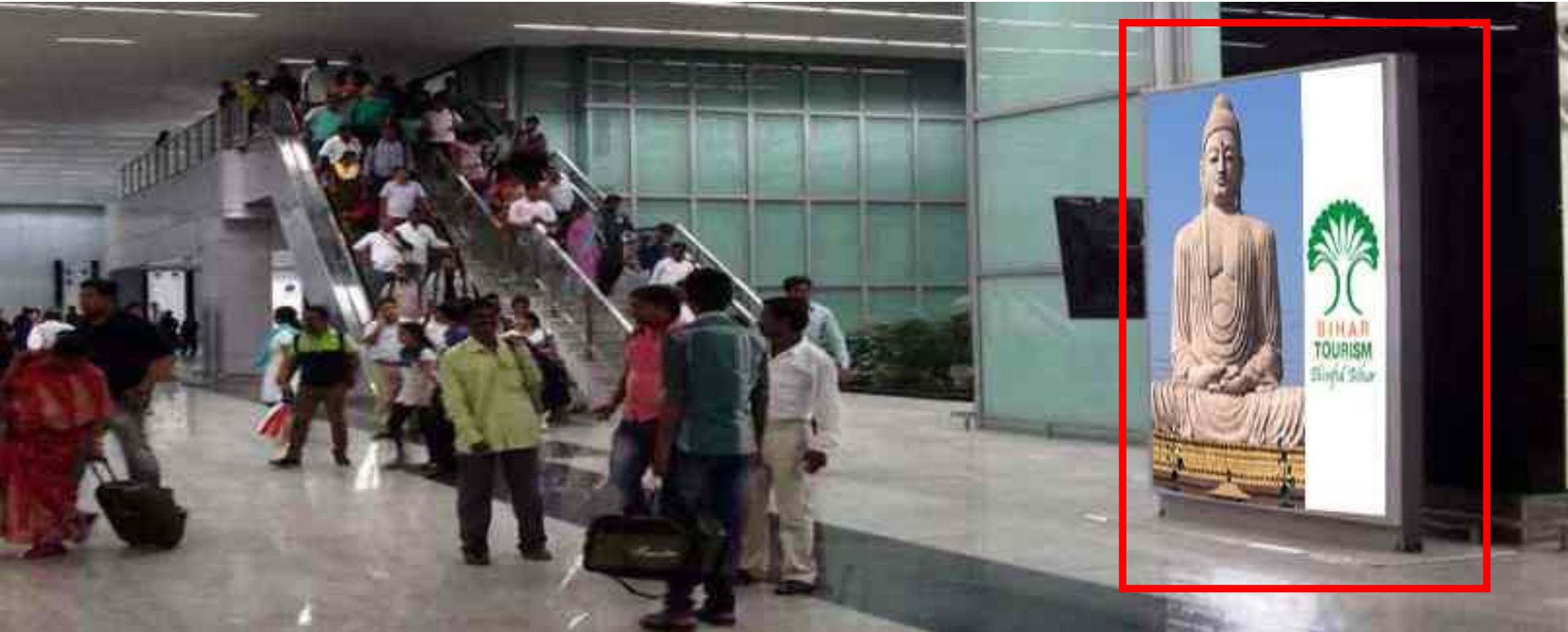
Site no: 03 of Size 6' x9' (Backlit display on the two sides of the baggage collection area in the Indigo Zone )