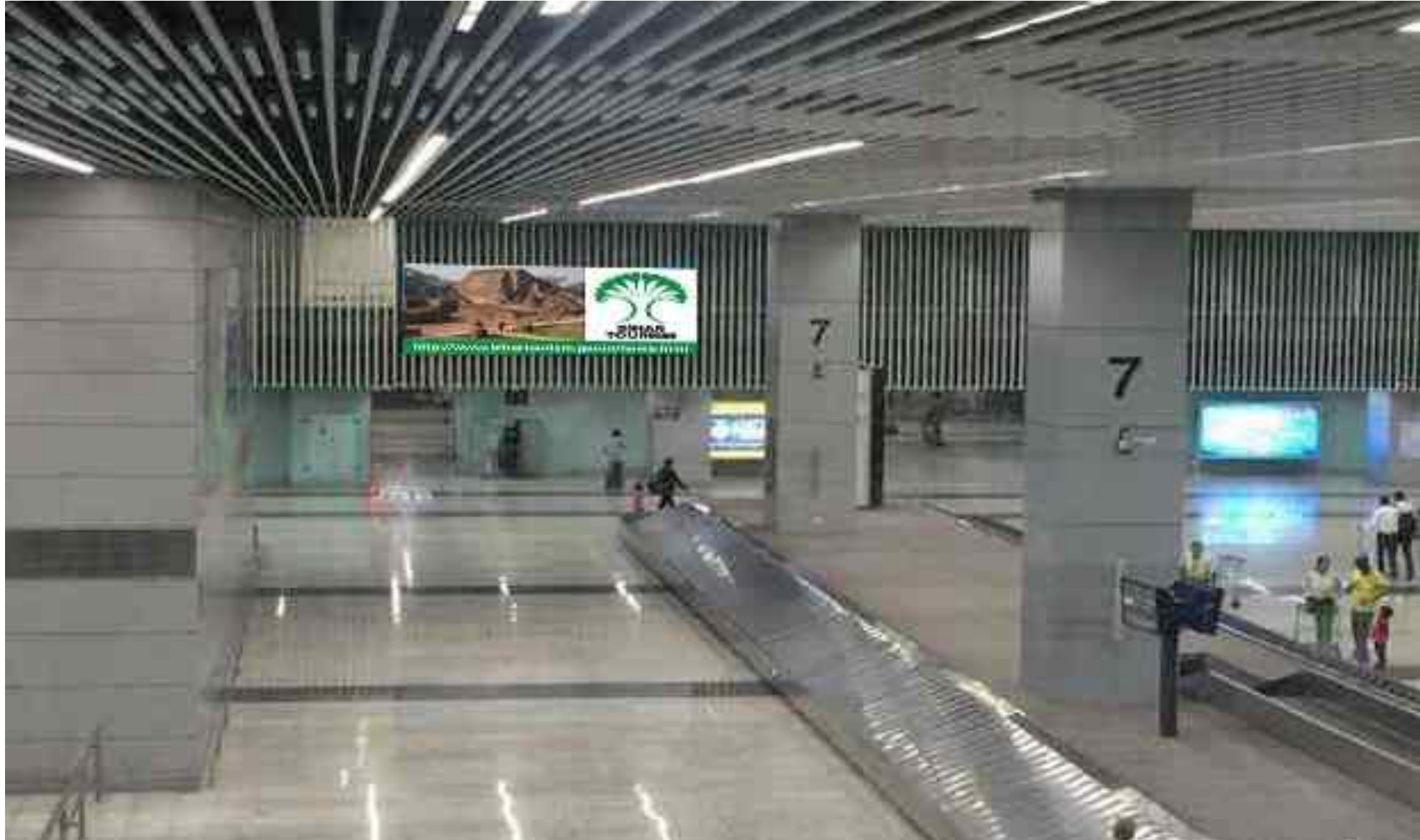
Site no: ARRIVAL LOUNGE of Size 21' x 07' (SUBJECT TO AVAILABILITY) (Ambilit Self Adhesive Vinyl display on the right side wall of the Pre Security Check)