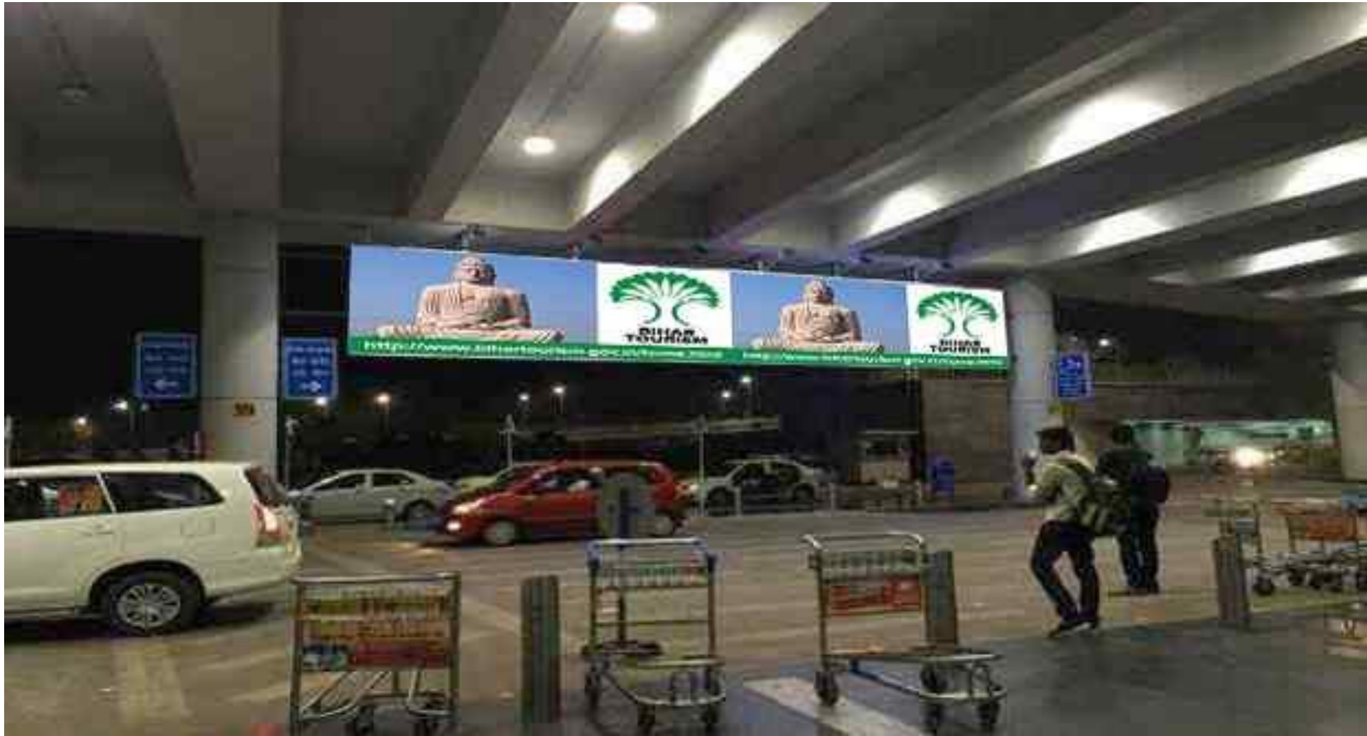
Site no: 05 of Size 48' x 8' ( INTERNATIONAL PASSENGER TARGETING ) (Frontbilit hoarding head on display under the arrival canopy perpendicular and in between domestic arrival exit gate no. 4)