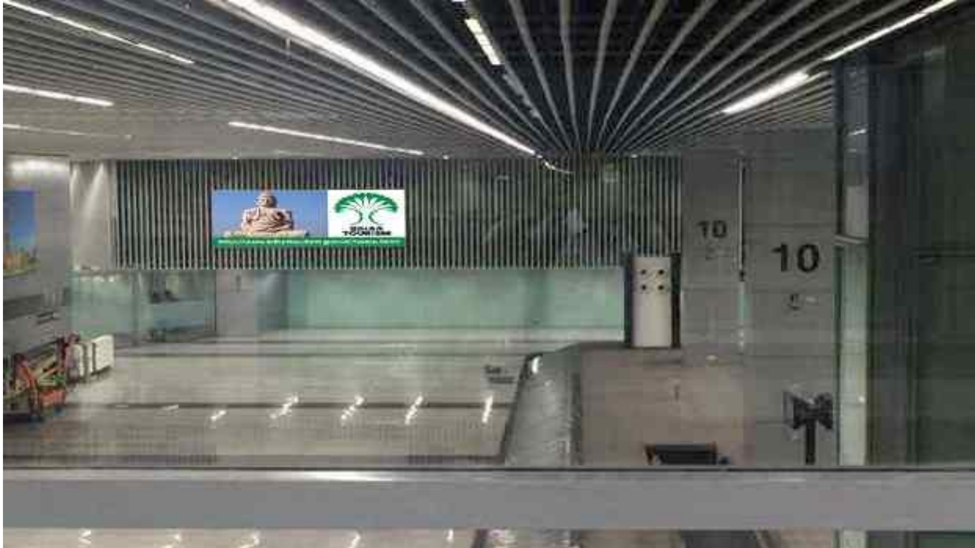
Site no: ARRIVAL LOUNGE of Size 21' x 07' (SUBJECT TO AVAILABILITY) (Ambilit Self Adhesive Vinyl display on the right side wall of the Pre Security Check)